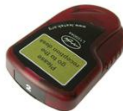
Alpha Belt Clip Pager